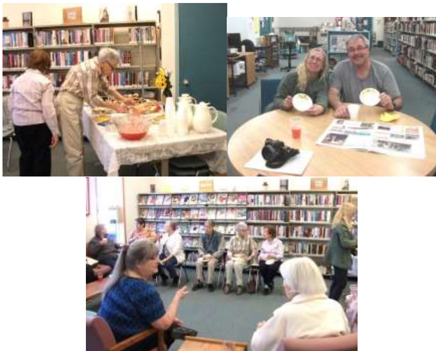
Volunteers, patrons and friends join Library Board Members and Staff for a most enjoyable afternoon.

The Annual Spring Tea for Volunteers and Library Friends was held April 29 th , 2016. We hope that the forty-four volunteers and guests enjoyed the Annual Spring Tea as much as we enjoyed being able to show our heartfelt appreciation for all that our Library friends do for us throughout the year.